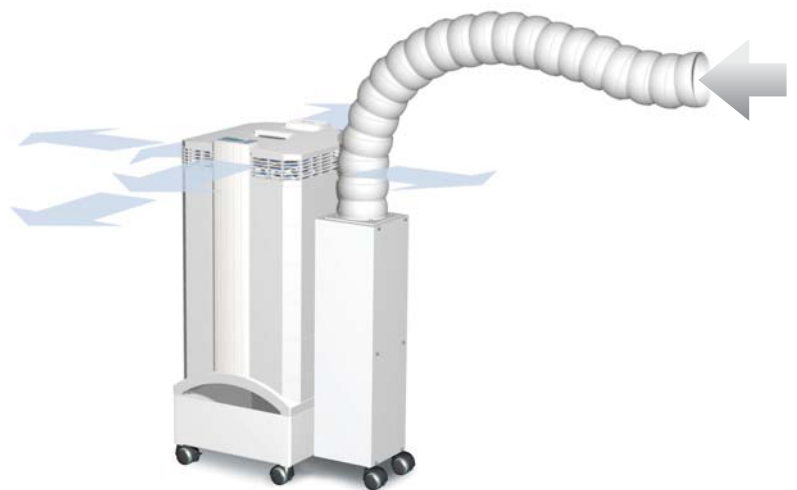
Principle of operation

The FlexVac accessory is compatible with all IQAir compact stand-alone filtration devices. The system cannot be used in combination with the following IQAir accessories: PF40 (coarse dust pre-filter kit), Mobility 56 (raised caster kit), InFlow W125 (ducting adapter kit) and the VMF (wall-mount bracket).